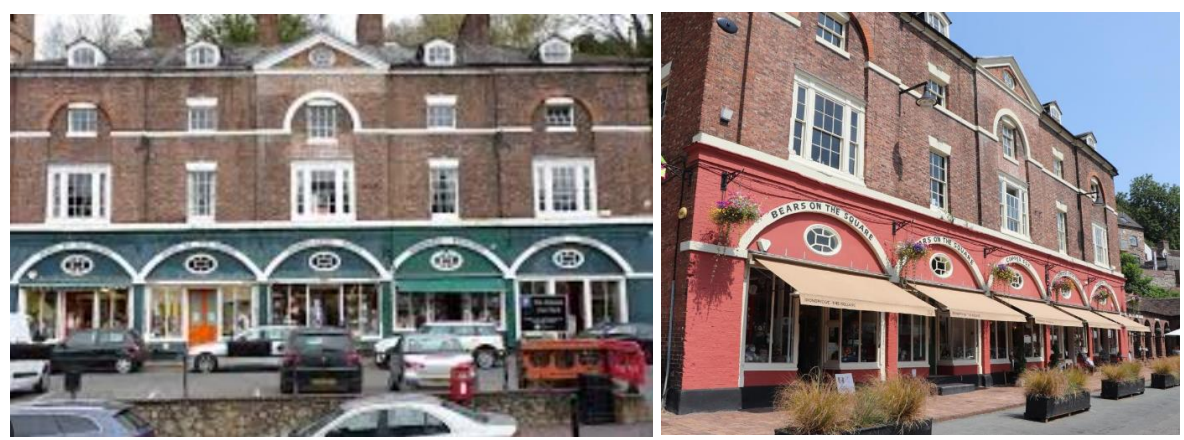
Shops in the Square, Ironbridge Before & After Façade Improvements

The façade improvement programme saw almost 100 properties transformed across the borough high streets. Making our high streets more attractive and inviting for visitors and residents. Heritage colours and period features were reintroduced into Ironbridge and Wellington and we were able to transform the conservation area to attract new visitors and footfall to our high streets.