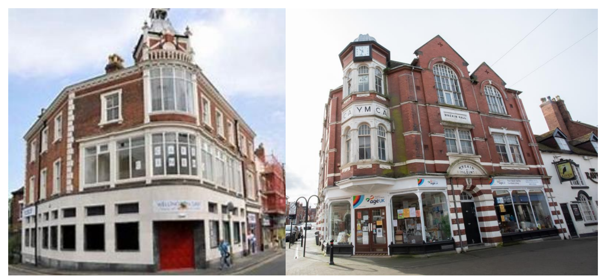
1 Walker Street, Wellington